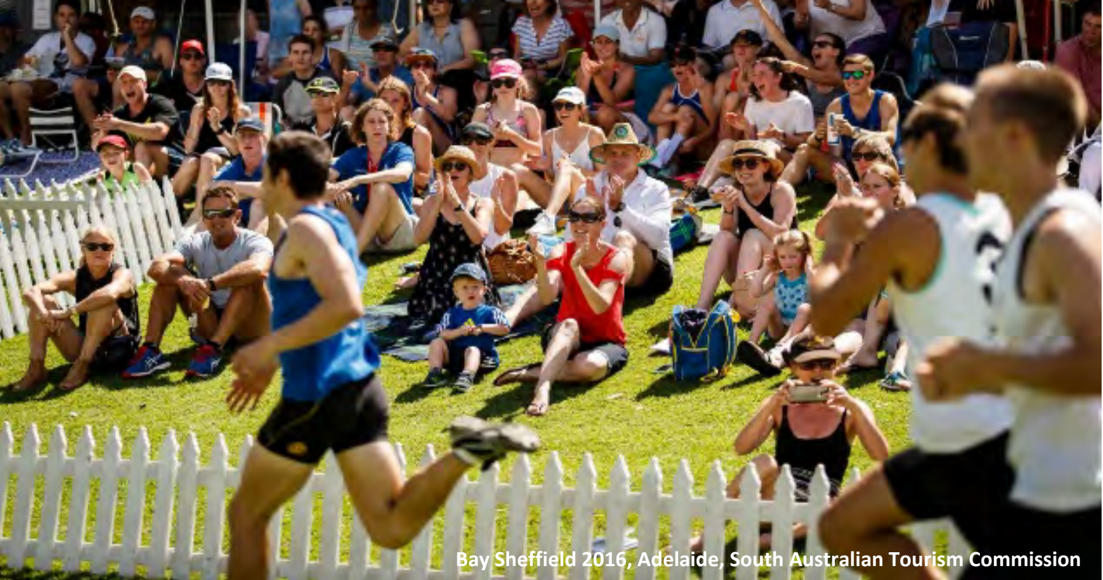
Bay Sheffield 2016, Adelaide, South Australian Tourism Commission